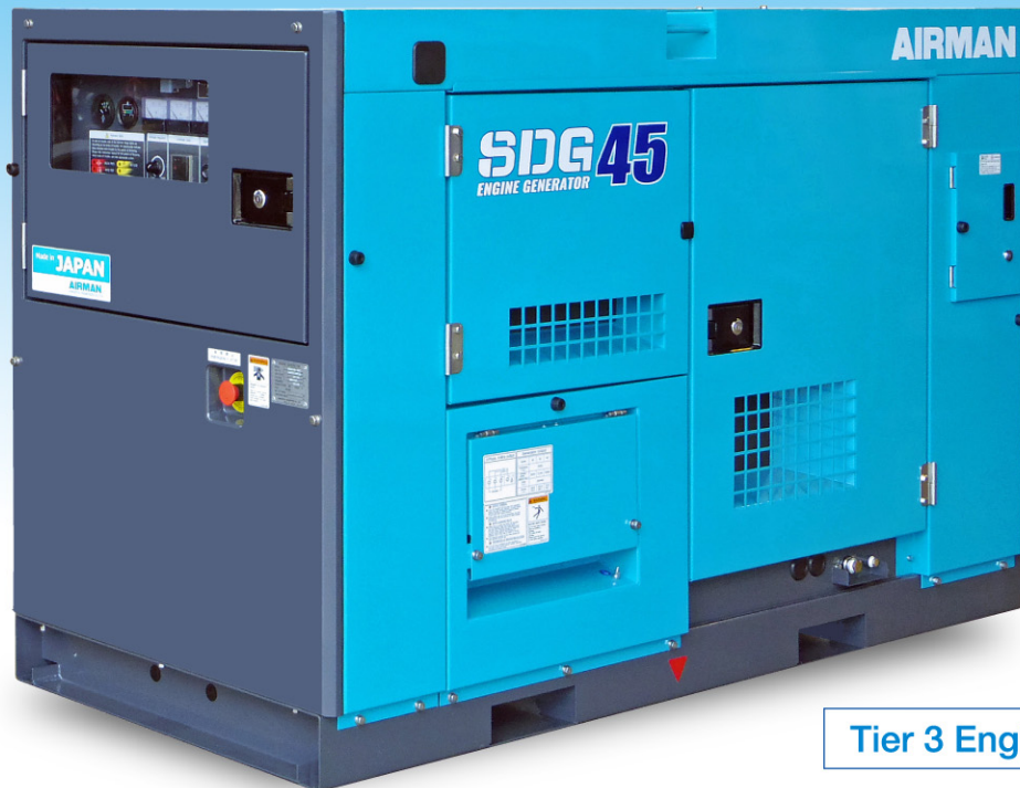
Tier 3 Engine installed